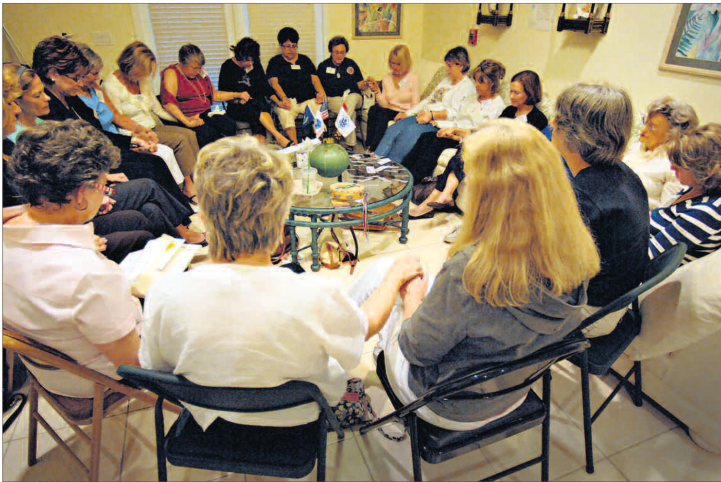
Each woman says a prayer as the group holds hands and prays together during a meeting of the Military Moms Prayer Group that meets every Thursday at the Women's Refuge in Vero Beach.